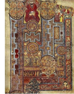
Book of Kells

Visit the magnificent library of Trinity College Dublin to view the beautiful Book of Kells , the splendidly illuminated version of the Christian Gospels dating from the 9th century.