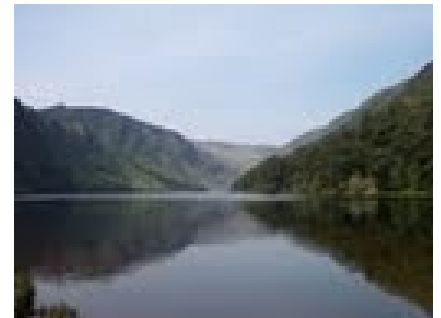
Upper Lake, Glendalough