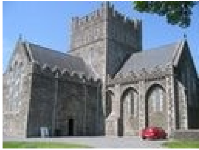
St. Brigid's Cathedral (Anglican)

Travel by motor coach through the heartland of Ireland. Stop in Kildare to visit St. Brigid's Cathedral (13 th century), located on the site of St. Brigid's monastery. St. Brigid lived in the 5 th century and is one of Ireland's patron saints, along with Patrick and Columba. Revered for both her common-sense and her holiness, St. Brigid set an early standard for the service of women in the church. Continue on to Glenstal Abbey in County Limerick. Overnight in Glenstal Abbey.